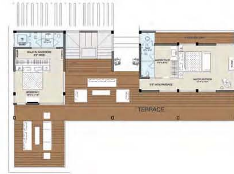
FIRST FLOOR LEVEL PLAN