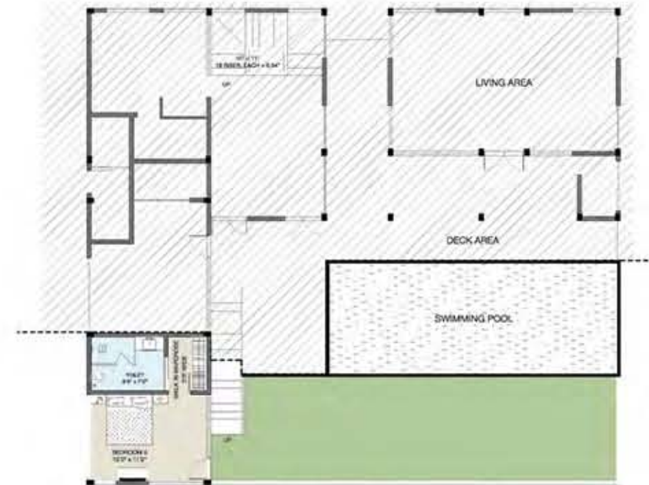
BELOW GROUND LEVEL PLAN