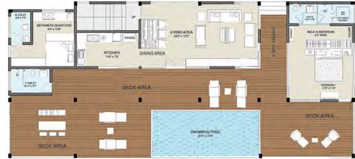
GROUND LEVEL PLAN