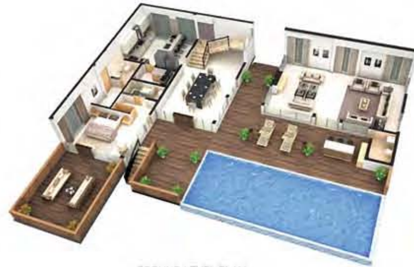
GROUND LEVEL PLAN