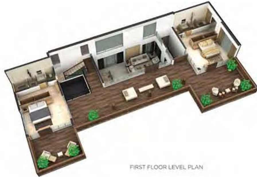
FIRST FLOOR LEVEL PLAN