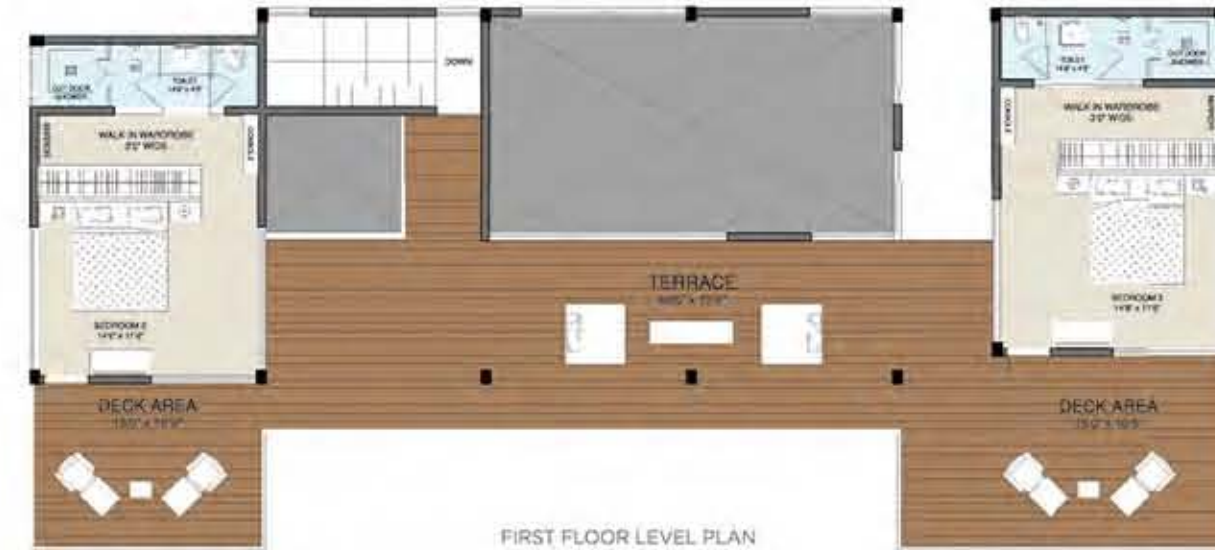
FIRST FLOOR LEVEL PLAN