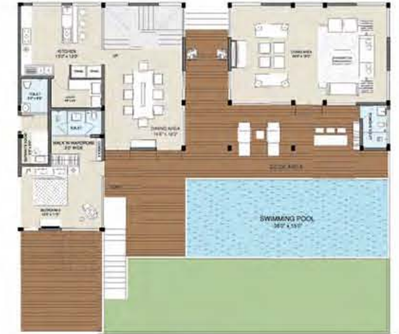
GROUND LEVEL PLAN