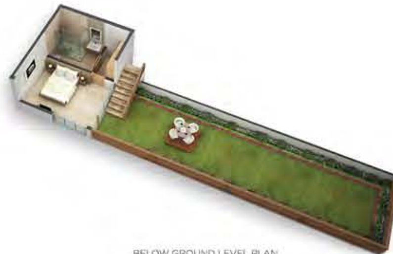
BELOW GROUND LEVEL PLAN