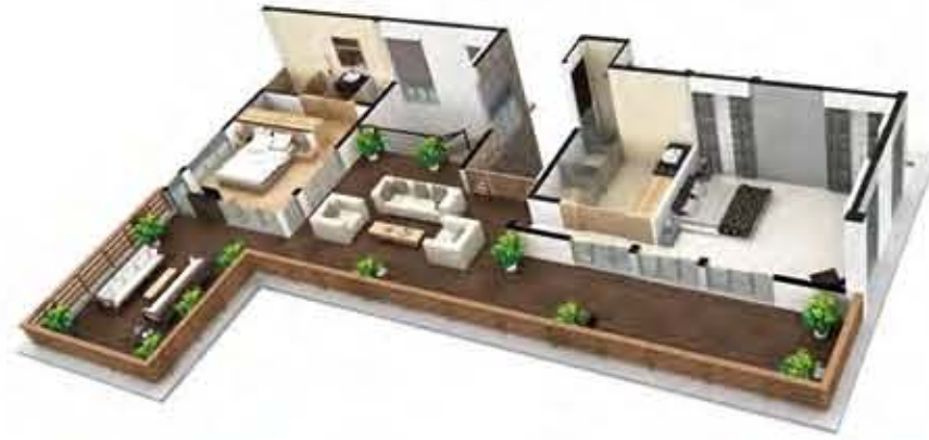
FIRST FLOOR LEVEL PLAN