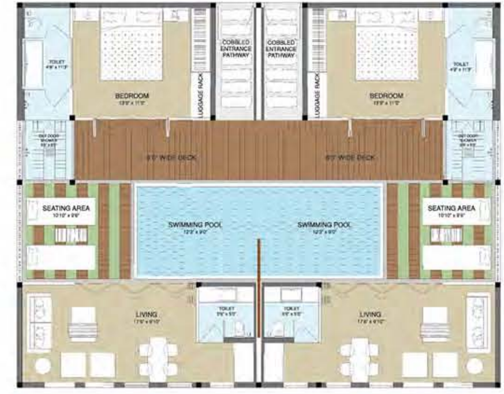
GROUND LEVEL PLAN