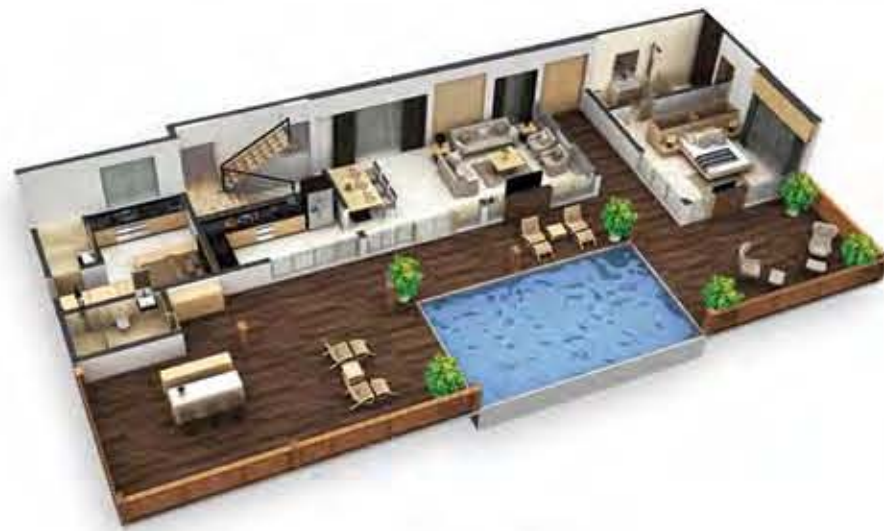
GROUND LEVEL PLAN