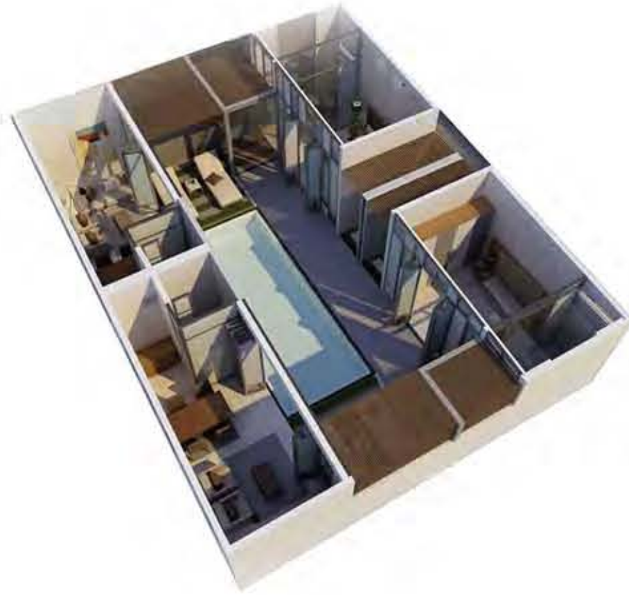
GROUND LEVEL PLAN